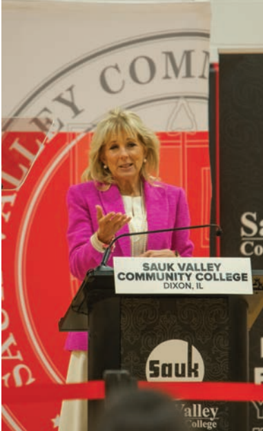
A Visit from First Lady, Dr. Jill Biden

On Monday, April 19, First Lady Dr. Jill Biden visited Sauk Valley Community College. She was joined by Education Secretary Dr. Miguel Cardona, Governor J.B. Pritzker, Congresswoman Cheri Bustos, and a myriad of other special guests.